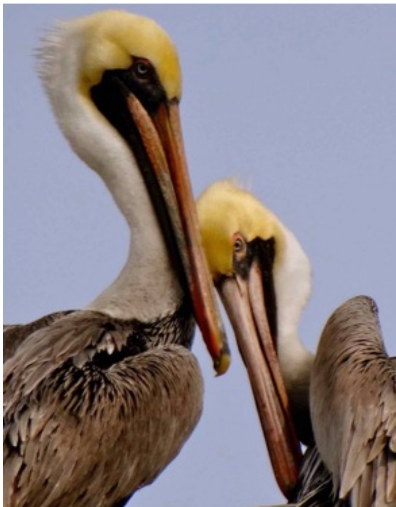
A pair of adult Brown Pelicans in basic or non breeding plumage. In nesting season, when they're in breeding or what's called alternate plumage, the birds would have brown feathers along the back of the neck.