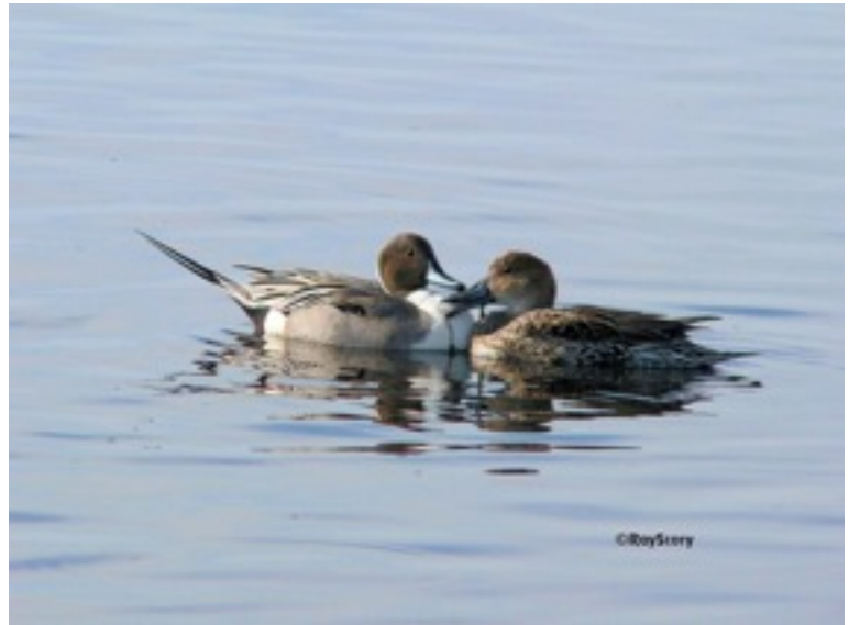
Top photo, a flock of Northern Pintails at MINWR; Bottom photo is a pair of Northern Pintails, male and female.