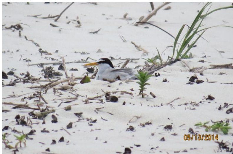
Least Tern on the nest last year.

There's no guarantee that the birds will return this year since they were unsuccessful last year. We're just trying to get ahead of the game and have people ready if the birds do show up.