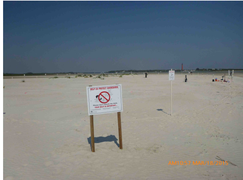
Disappearing Island with the Lighthouse in the background