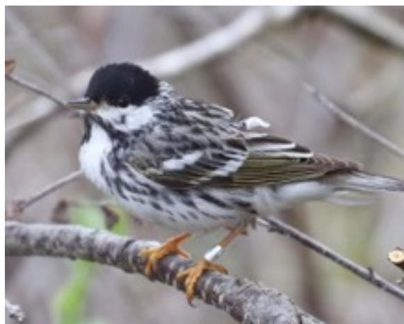
Blackpoll Warbler, photo by Christian Artuso

A research team, led by the University of Guelph and Bird Studies Canada, recaptured 27 Blackpoll Warblers that had been fitted with geolocators to track their migration routes. These tiny birds, weighing less than half an ounce, have now been shown to fly non stop over 1,700 miles of open ocean on their way from the northeastern US to the Antilles and northern South America. Here's a link to this fascinating article.